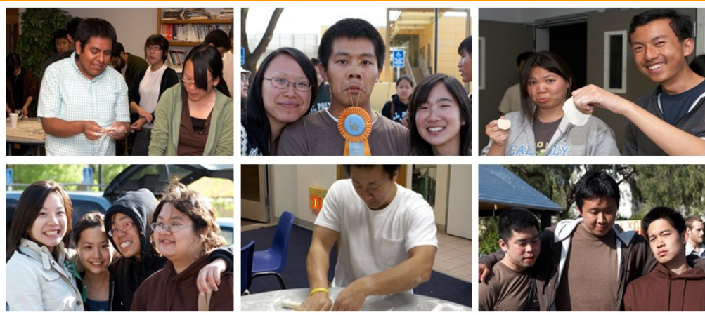
Open House: still making “Potstickers!” This year we received the award for “Best Ethnic Food! “