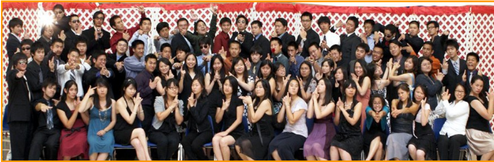
CCF Family Portrait @ Brothers Appreciation Night!

This year it was the CCF sisters' turn to put on a special formal event to appreciate our brothers. The sisters put on a night of food, corporate worship, and activities. We had a secret agent or 007 theme, "The World is Not Enough," alluding to our call to dwell on things above and the purpose God has given us in this life. The sisters had fun preparing food and putting together slideshows, activities and even a maze in the SLO Nazarene church gym.