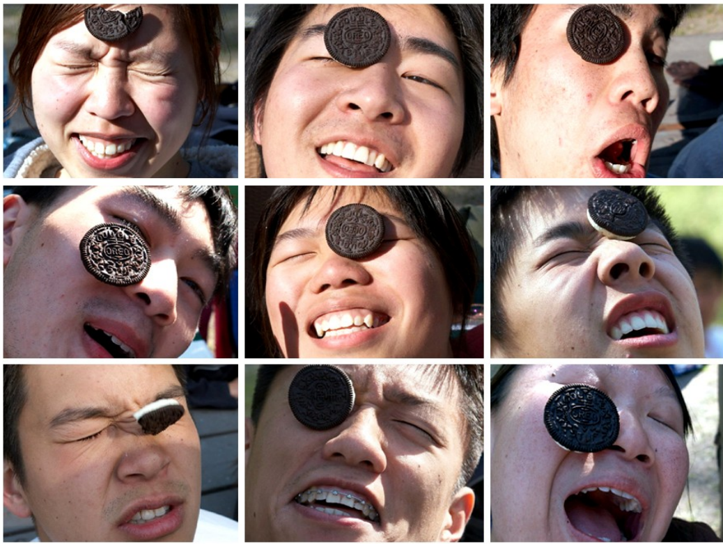
CCF Retreat: Oreo Faces